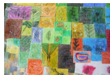
Photo montages and recreating paintings